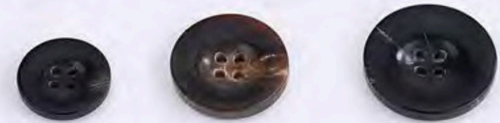
24NB-6216B 24NB-6216A 24NB-6216