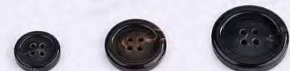
24NB-6218B 24NB-6218A 24NB-6218