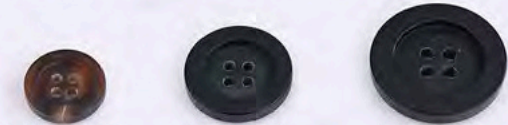
24NB-6217B 24NB-6217A 24NB-6217