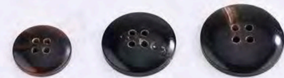
24NB-6207B 24NB-6207A 24NB-6207