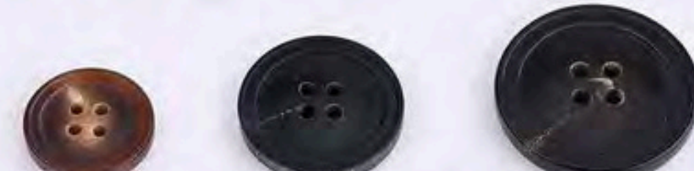
24NB-6214B 24NB-6214A 24NB-6214