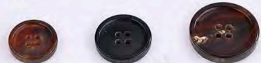
24NB-6213B 24NB-6213A 24NB-6213