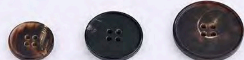
24NB-6206B 24NB-6206A 24NB-6206