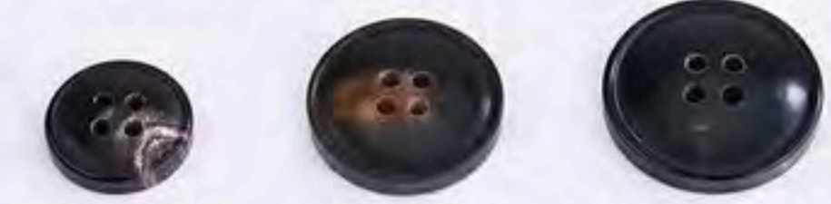
24NB-6208B 24NB-6208A 24NB-6208