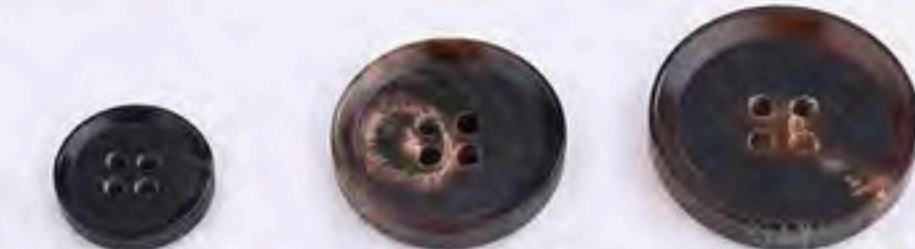
24NB-6205C 24NB-6205A 24NB-6205