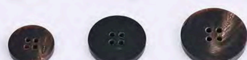
24NB-6215B 24NB-6215A 24NB-6215