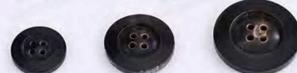
24NB-6219B 24NB-6219A 24NB-6219