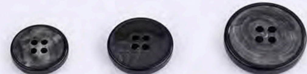
24NB-6211B 24NB-6211A 24NB-6211