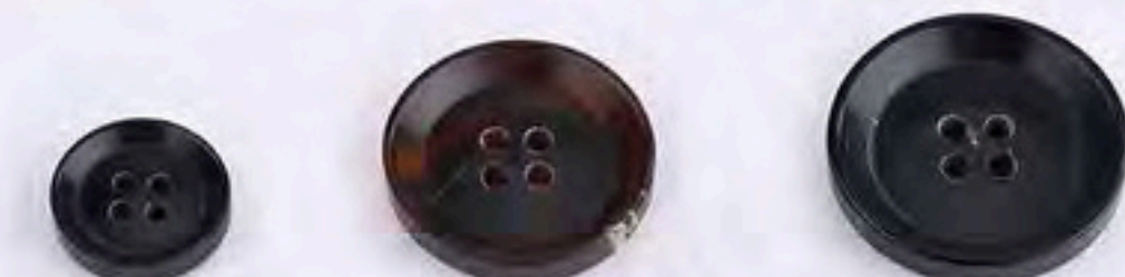
24NB-6210B 24NB-6210A 24NB-6210