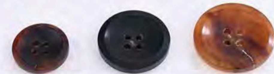
24NB-6209B 24NB-6209A 24NB-6209